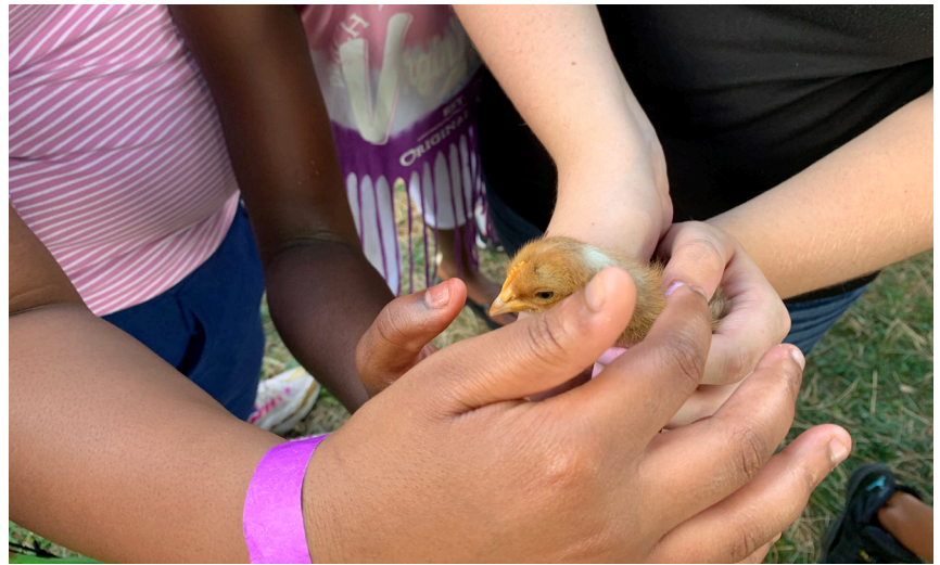
Charlottesville youth hold a chick they incubated as part of the Ag in the City program.

Local Family and Consumer Sciences, Agriculture and Natural Resources, and 4-H Extension agents use the Ag in the City program to teach Charlottesville youth about agriculture, how it relates to them, and how they can make healthy decisions as consumers. Youth participate in a variety of agriculture- and nutrition-related experiences and interact with local professionals in the field.